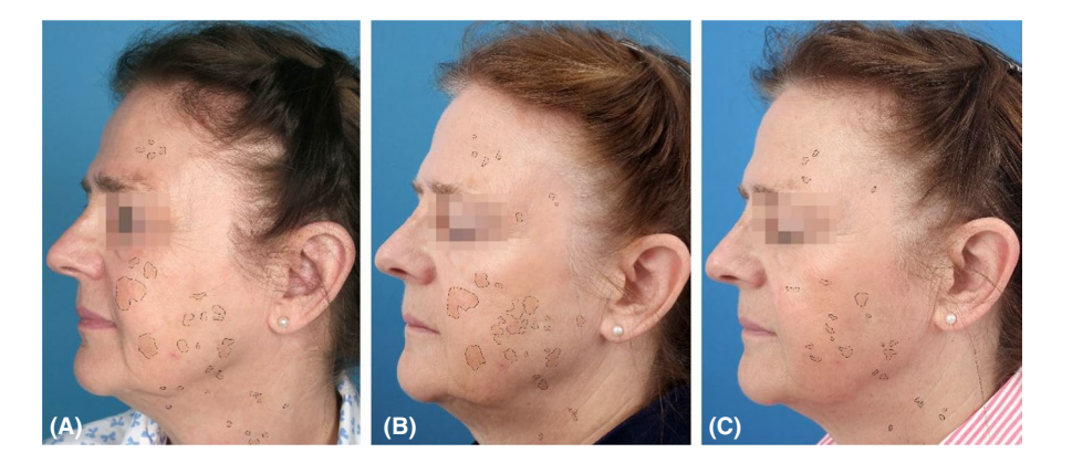
FIGURE 1 Standardized pictures obtained using a Visia camera system (Candfield); before the Kleresca® prepost treatment (A), 1 wk after the second Kleresca® session and immediately prior to the treatment with the QS-ruby laser (B), and 3 wk after the QS-ruby laser treatment (C) were used to track the changes in pigmentation. (D) Graph shows the % area of pigmentation identified from the patient pictures

Here, we present a 67-year-old woman with histologically confirmed SL (Figure 1A) treated with the Kleresca<sup>®</sup> treatment (FB Dermatology, Ireland). Treatment comprised the application of a 2mm layer of the Kleresca<sup>®</sup> pre-post photoconverter gel followed by irradiation with a multi-LED lamp (447 nm), as per the instructions for use. A double/stacking treatment consisting of one 9-minute treatment session, a 10-minute interval, and a subsequent 9-minute treatment session was completed once a week for 2 weeks. One week after the second Kleresca<sup>®</sup> treatment session, the patient was treated with a 694 nm Qs-ruby laser using a 4-mm spot with